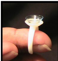
EZI APPLICATOR RING