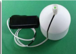
DALSEY SEE GREEN LENS STAND