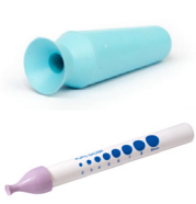
DMV LARGE PLUNGER (TOP) DMV LUMASERT (BOTTOM)