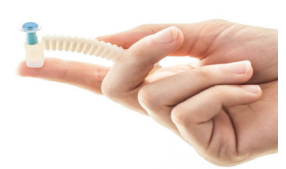
CLIARA CHIO A&R DEVICE